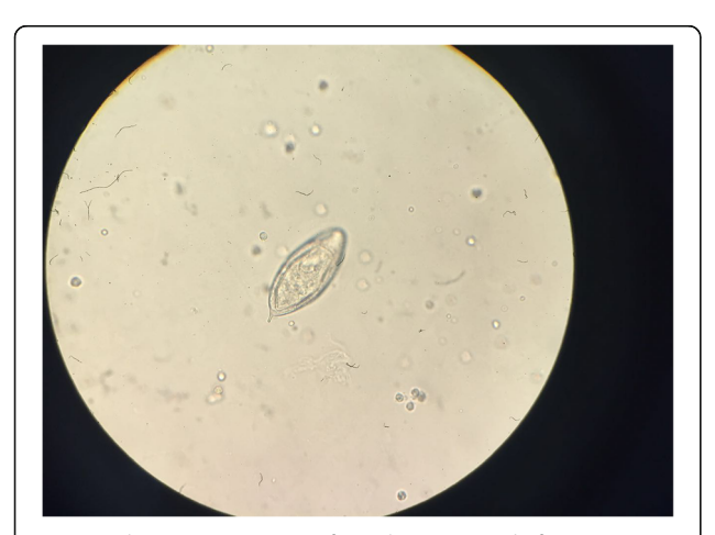
Fig. 2 Sediment examination of a 24-h urine sample from case 1 demonstrates the diagnostic terminal spine of egg of Schistosoma haematobium (original magnification, \times 400; no stain used)

prevalent in sub-Saharan Africa and parts of the Middle East [2]. Our patient was in mauritania which is a contact point between north africa and sub-saharan africa. The life cycle of S. haematobium begins with the presence of eggs in the urine of affected patients; miracidia hatch and penetrate into intermediate hosts - snails; the development of cercariae and the release of snails into the water; the cercariae enter the human skin and migrate through the venous circulation into the liver, where the moat reaches maturity; adult flukes move to the venous plexus of the bladder, where female worms lay eggs; finally, the eggs migrate to the lining of the bladder and complete the life cycle [2, 7]. Our patient contracted the parasite through contact with contaminated water. The definite test for the diagnosis of urinary schistosomiasis is the identification of S. haematobium eggs in the urine.